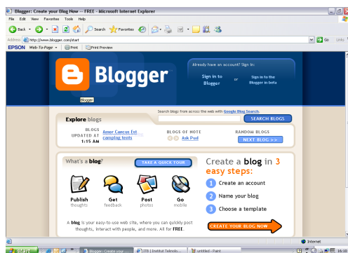
Figure 1: Dashboard of www.blogger.com